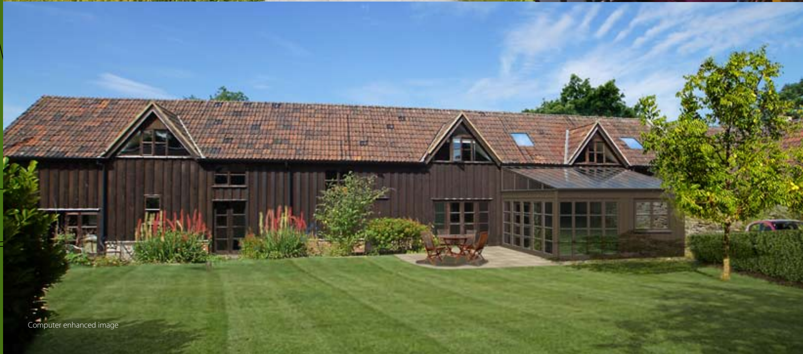
Computer enhanced image